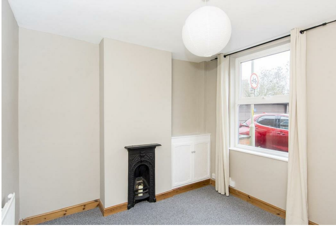
Lounge 10'11" x 10'1" (3.33m x 3.07m)

Accessed via UPVC opaque double-glazed front door. Double-glazed window to the front elevation. Feature cast iron period open fire place. Fitted base metre cupboard. Radiator. Stripped timber door to inner lobby.