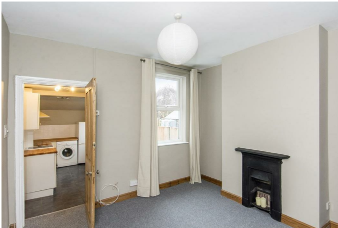
Dining Room 11'2" x 10'8" (3.40m x 3.25m)

Double-glazed window to the rear elevation. Radiator. Feature cast iron period open fire place. Stripped timber door to the stairs to the first floor. Stripped timber door to the kitchen.