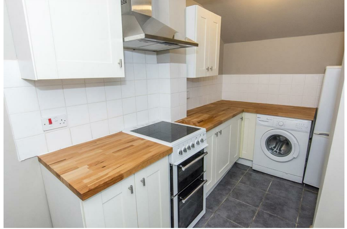
Kitchen 13'8" x 5'9" (4.17m x 1.75m)

Fitted base and wall units. Solid timber work surfaces with complimentary tiled splash backs. Fitted free standing electric cooker with stainless steel extractor hood over. Fitted automatic washing machine. Upright fridge/freezer. Stainless steel single sink and drainer. Two double-glazed windows to the side elevation. Double-glazed door leading out to the rear garden. Slate effect ceramic tiled flooring. Radiator.