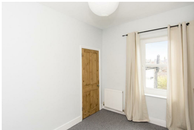
Bedroom Two 10'7" x 8'1" (3.23m x 2.46m)

Double-glazed window to the rear elevation. Radiator. Built in wardrobe with access to loft space.