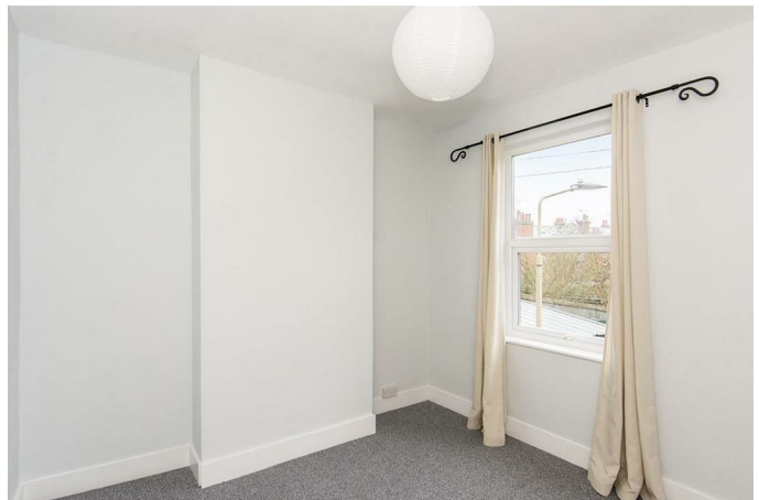
Bedroom One 10'11" x 10'1" (3.33m x 3.07m)

Double-glazed window to the front elevation. Radiator.